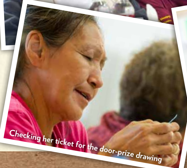
Checking her ticket for the door-prize drawing