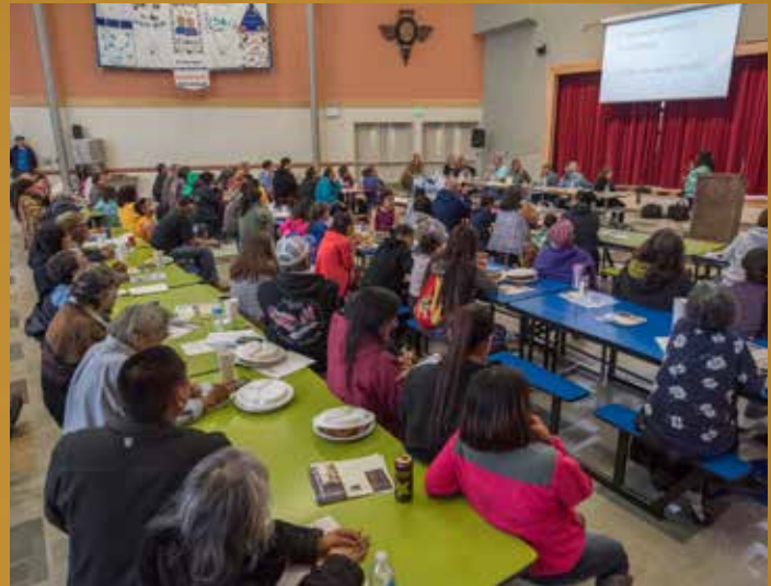
Presentation of shareholder report

Overall, it was a fun and informative annual meeting. Thank you again to all who participated.