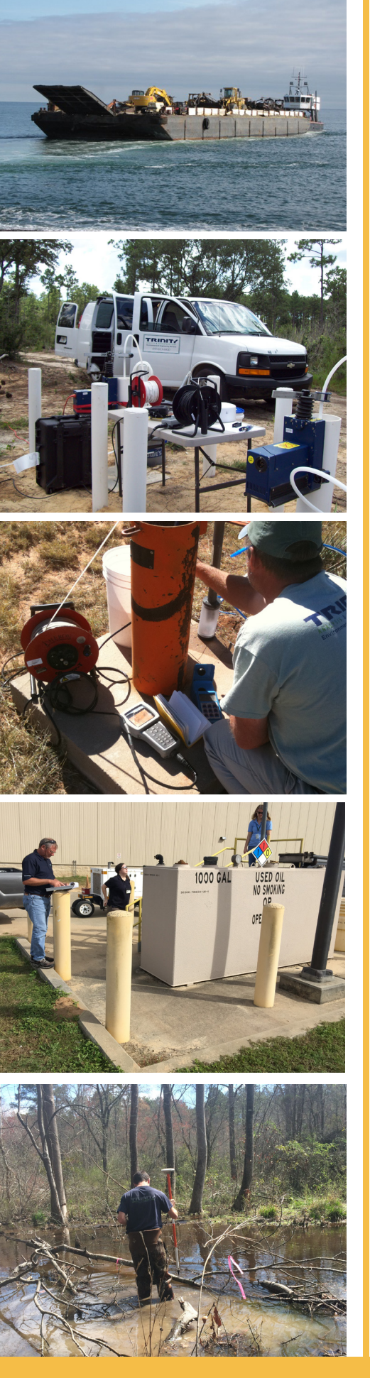
8(a) - Alaska Native Corporation Small Disadvantaged Business BONDING: $10M Individual / $20M Aggregate